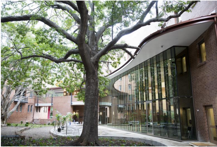
Sibyl Courtyard DONATED