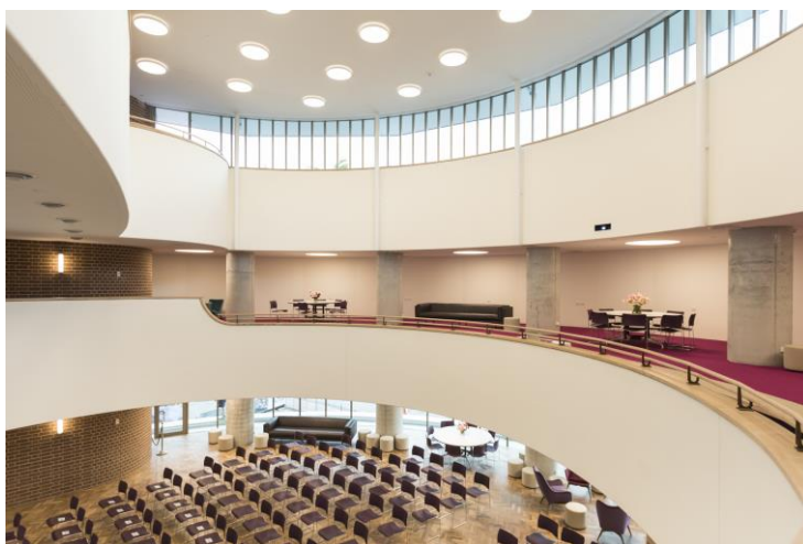
The Learning Lounge (Level 2)